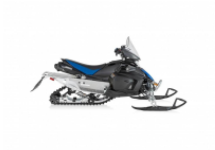
Viking 700 + $0.00