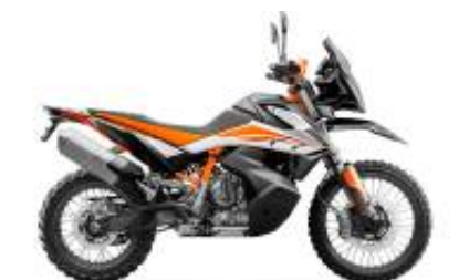
790 Adventure + ¥0