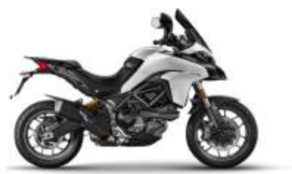
Multistrada 950 V2 + ¥0