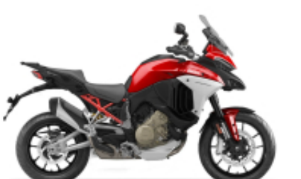
Multistrada V4 + ¥0