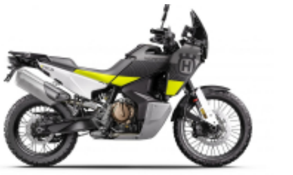
Norden 901 + ¥0