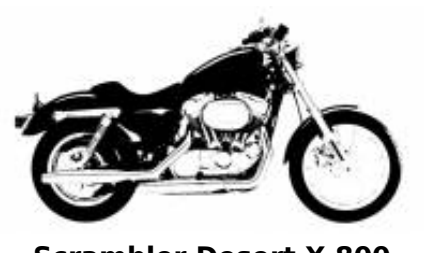
Scrambler Desert X 800 + ¥0