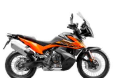
890 Adventure + ¥0