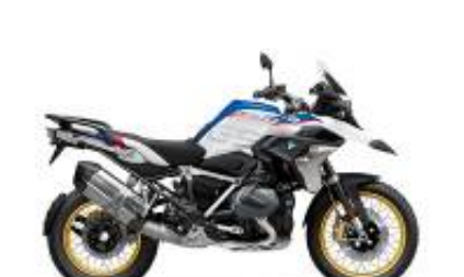
R 1250 GS HP Edition + ¥0