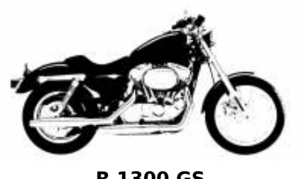
R 1300 GS + ¥0