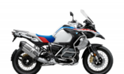
R 1250 GS Adventure + ¥0