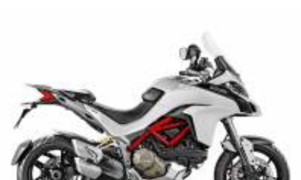
Multistrada 1260 V4 + ¥0