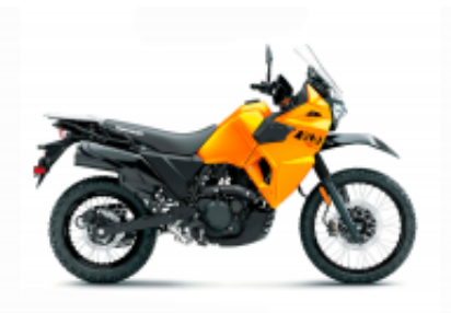
KLR 650 + $50.00