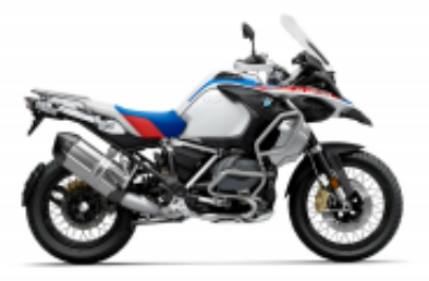
R 1250 GS Adventure + $172.74