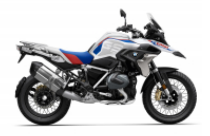
R 1250 GS + $115.16