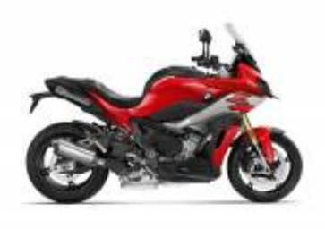
S 1000 XR + $172.74