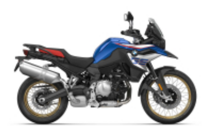
F 850 GS + $57.58