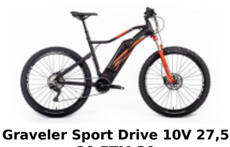
20.ETM.30 + $51.82