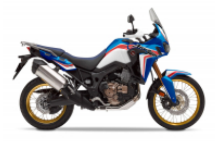
Africa Twin CRF 1000 L + 376.34.-