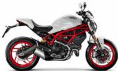
Monster 797 + $414.90