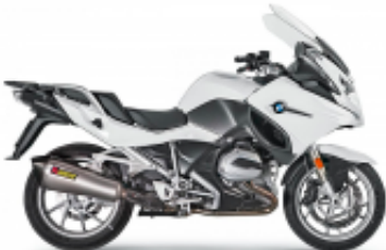
R 1200 RT + $474.17