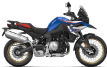
F 850 GS + $70.66