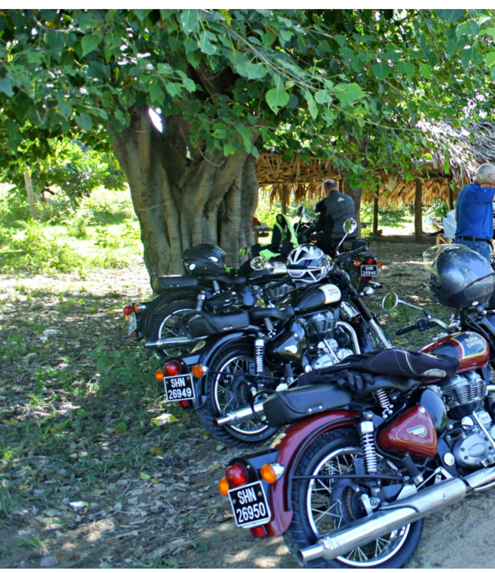
Motorcycle dual-purpose and Adventure, the Burman classic on Royal Enfield