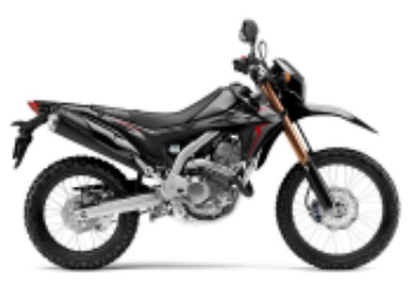
CRF 250 L + R$ 676,98