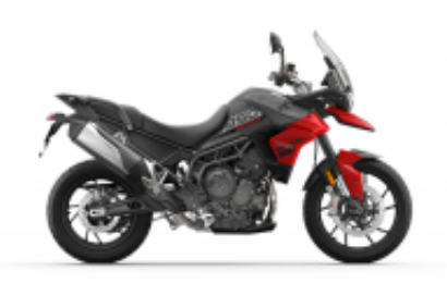
Tiger 850 Sport + 85,85 €