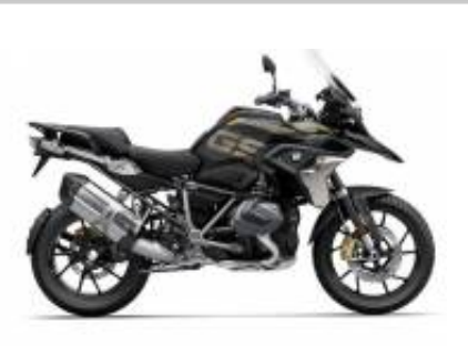
R 1250 GS LC + 386,33 €