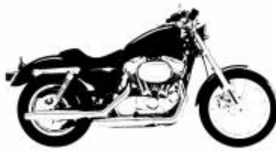
Street Glide GPS Incl. Street Touring Class + $0.00