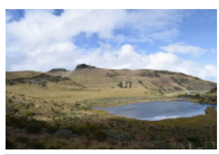
Day 7 Resting day at Salento

During this day riders will choose from different activities (Enjoys the coffee park, tour on Willis Jeep, visiting Cocora park, a butterfly farm, Muleteer museum or stay and do craft shopping in Salento town).