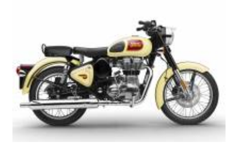
Classic 500 + £0.00