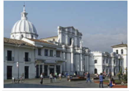
4 - San Agustín - Popayán - 210

We will have the unique experience to cross the Magdalena River in a small canoe departing early in the morning, in our way trees will make a sealing over the road, making riding through on a Royal Enfiel Classic 500 a real pleasure. We will go up to the Colombian Flowerbed to the origin of the Colombian mountain range and its rivers and spend the night in San Agustin, place of the archeological park a world heritage site (UNESCO).