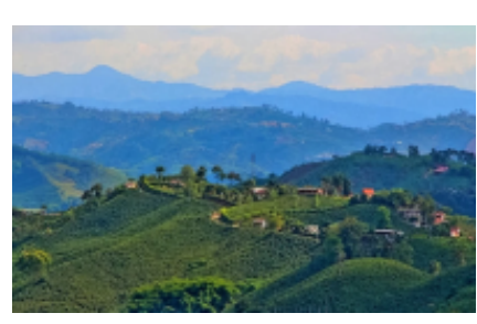
8 - Salento - Manizales - 210 Day 8 Salento - Manizales

During this day riders will choose from different activities (Enjoys the coffee park, tour on Willis Jeep, visiting Cocora park, a butterfly farm, Muleteer museum or stay and do craft shopping in Salento town).