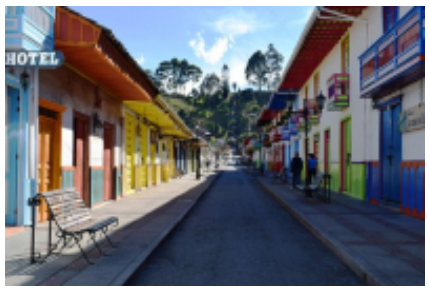
6 - Buga - Salento - 150

After a short walk through the city, the road will lead us to the warm valley of the Cauca River, towards Silvia, a picturesque and representative South American Andes Indian tribe. WE continue our ride through the valley filled with crops and plantations till we reach the Colonial and religious city of Buga.