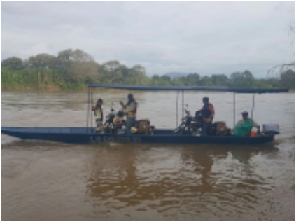
5 - Popayán - Buga - 180

A less travelled road enjoyable by motorcycle that passes through Purace Natural park, with volcanoes (11) and the "Pan de Azucar" at 5000 meters above sea level, Purace at 4780 meters above sea level and the Coconuco at 4600 meters above sea level. Long off road paths with abundant highland vegetation. In the afternoon we will reach the Colombian colonial white city of Popayan.