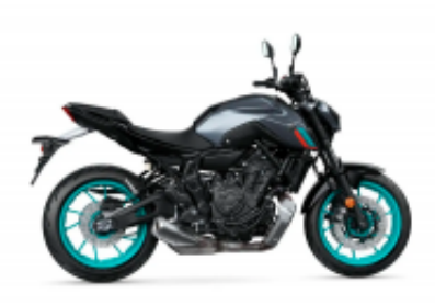
MT 07 700 (A2) + R$ 0,00