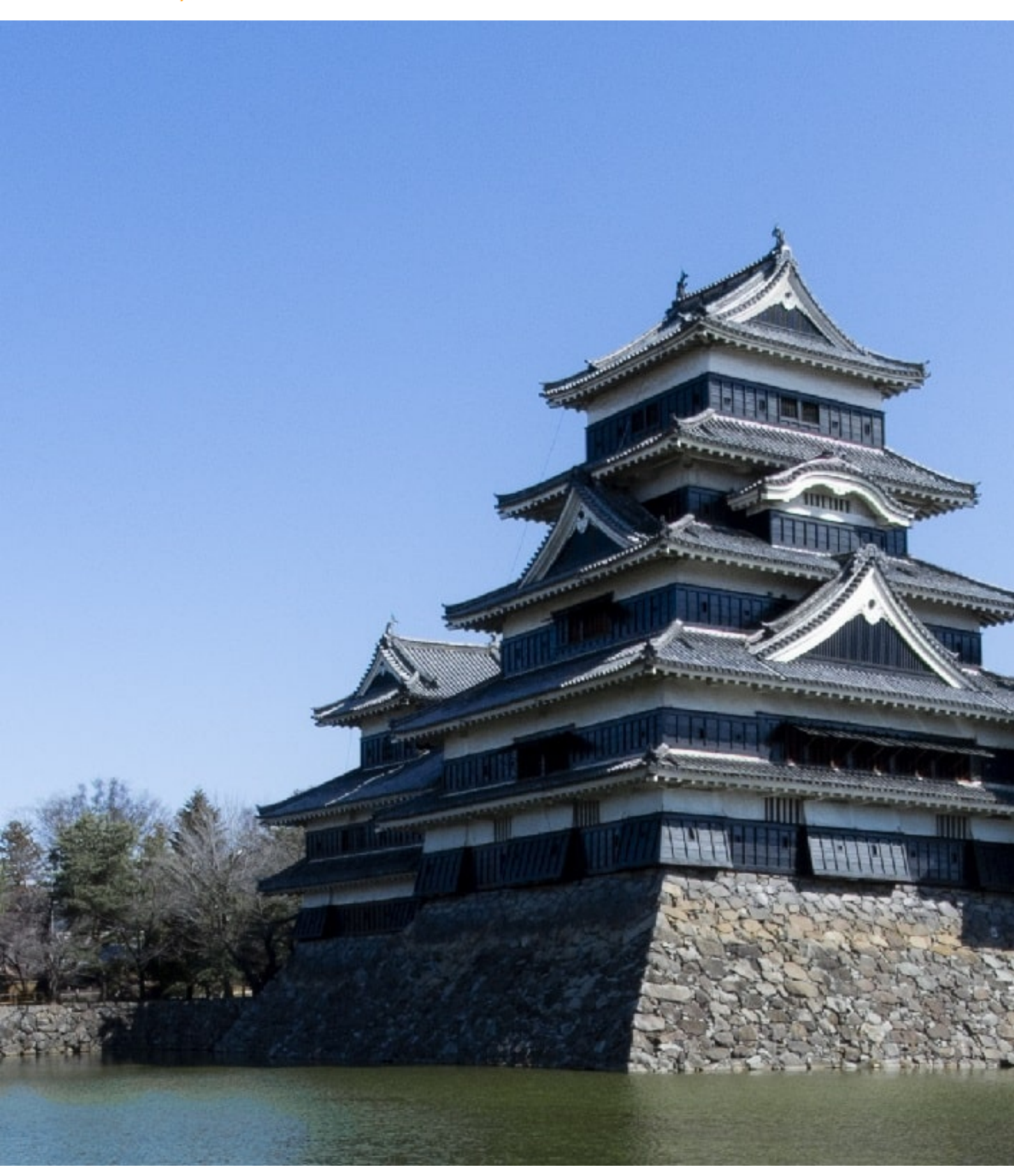
Motorcycle dual-purpose and Adventure, Symbol of Japan's Mount Fuji tour