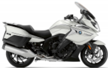
K 1600 GTL + $690.96