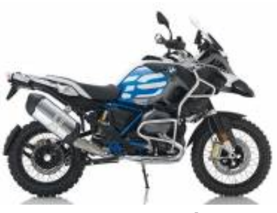
R 1200 GS Adv + R$ 1.534,25