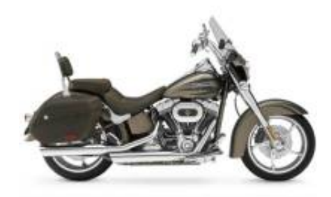
Softail + $965.62