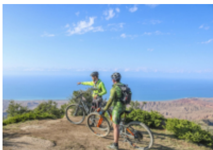
4 - Kegeti - Kočkor - 75