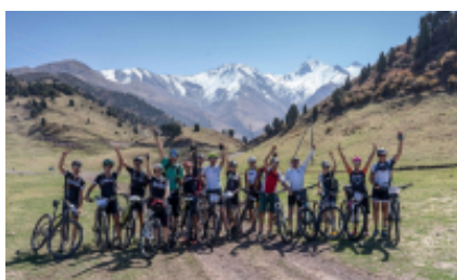
5 - Kočkor - Songköl - 60