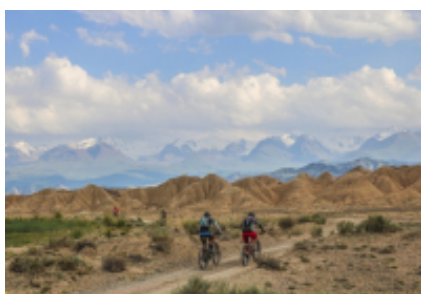
6 - Songköl - Kočkor - 65