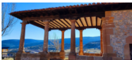
3 - Alcalá de la Selva - Mosqueruela - 54