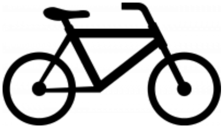
La mia bicicletta + $0.00