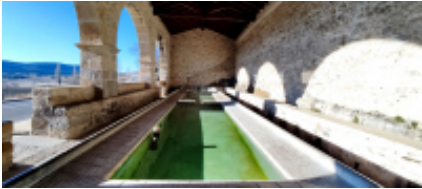
9 - Barcellona - Barcellona - 0