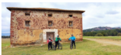
7 - Albarracín - Teruel - 37