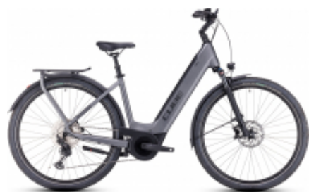
Touring Hybrid 500 Easy Entry + 28.06.-