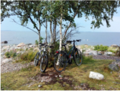
8 - Koguva - Varbla - 51