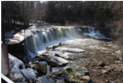
2 - Tallinn - Padise - 65