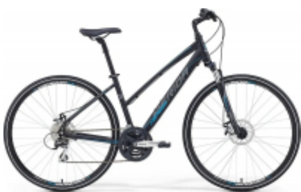
Crossway 20 Lady + 14.97.-