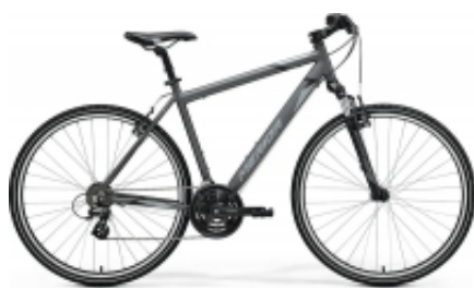
Crossway 20 Man + 14.97.-