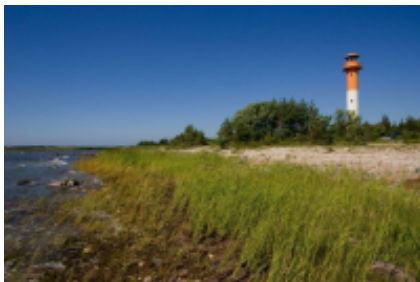
4 - Haapsalu - Kardla - 38