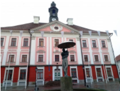
10 - Pärnu - Tallinn -