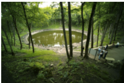
5 - Kardla - Saaremaa - 58