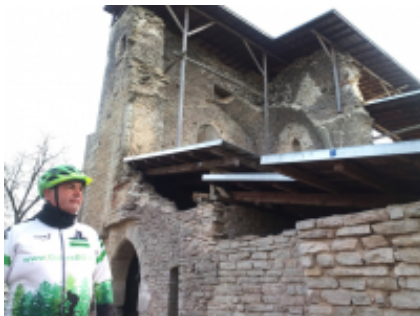
3 - Padise - Haapsalu - 55