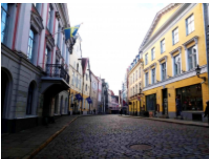
11 - Tallinn - Tallinn -