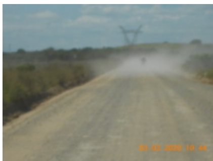
2 - Addo - Hogsback -