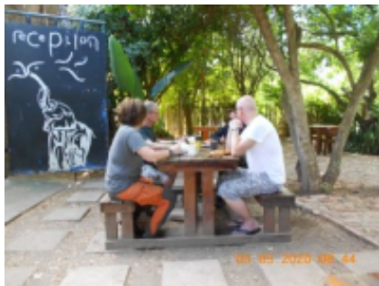
1 - Port Elizabeth - Addo -