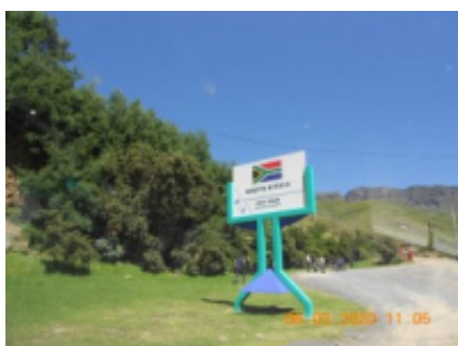
5 - Underberg - Sani Pass -