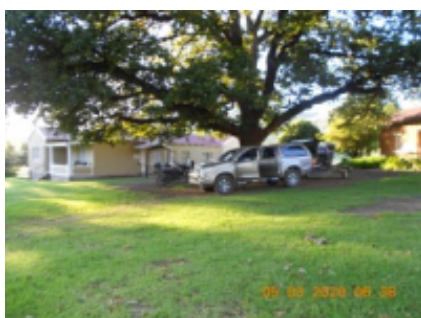
4 - Maclear - Underberg -