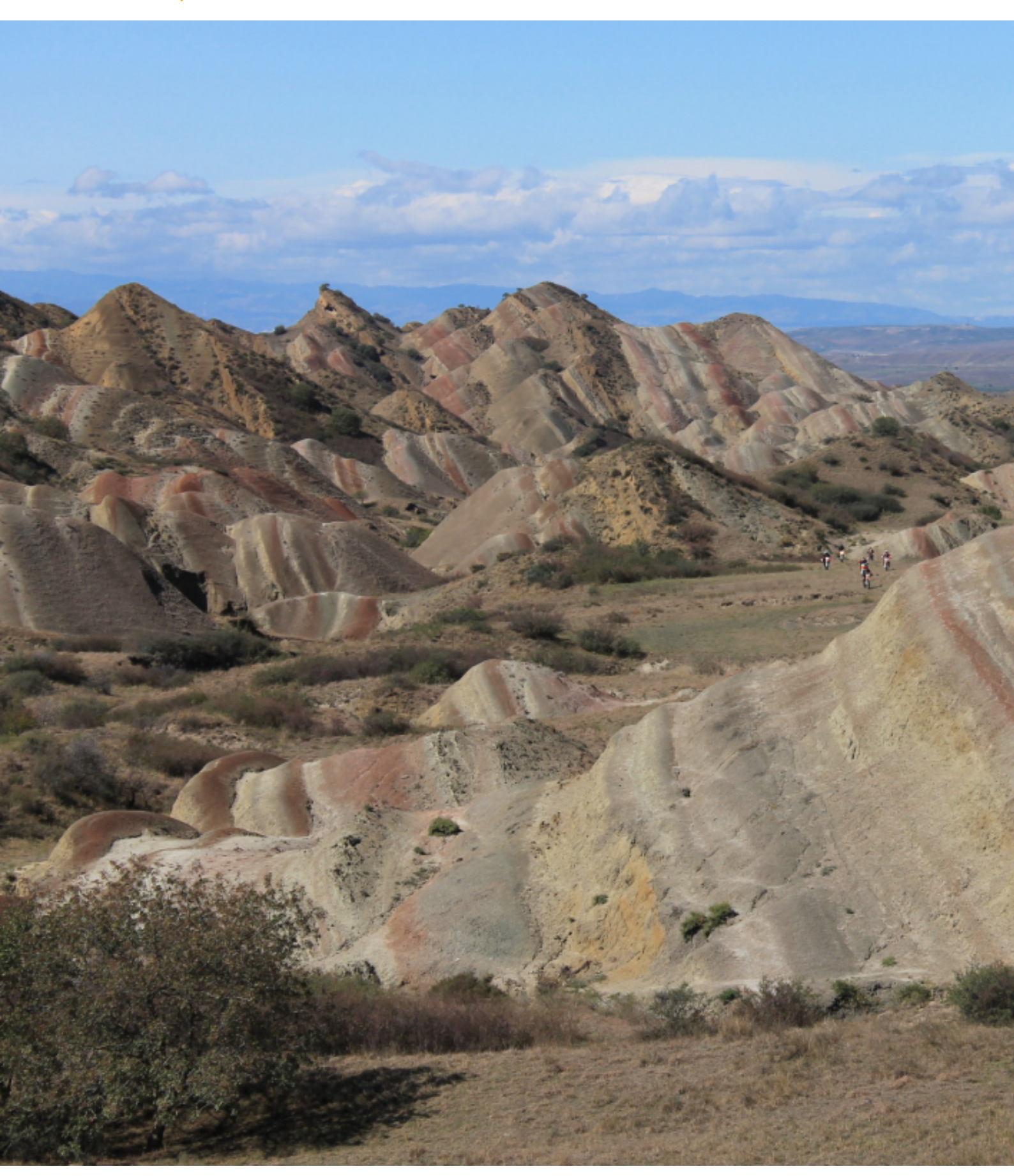
Motorcycle Enduro off, Road hike through the savannah and the Greater Caucasus Eastern Georgia