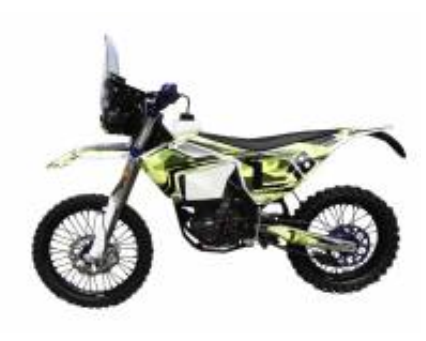
Rally 450 + $0.00