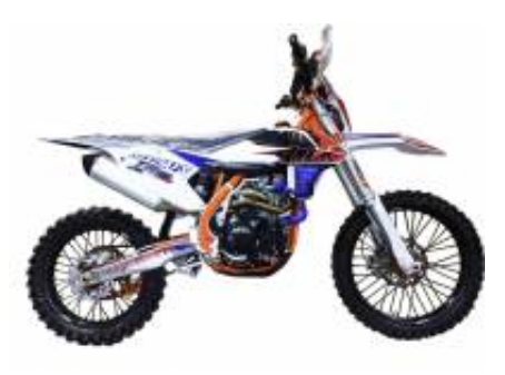
Sixdays 450 + $0.00