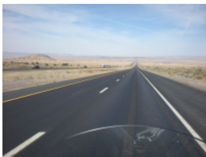
1 - - Los Angeles - 0 km