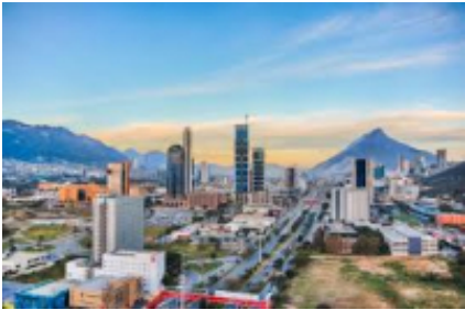
14 - Monterey - Pismo Beach - 243 km