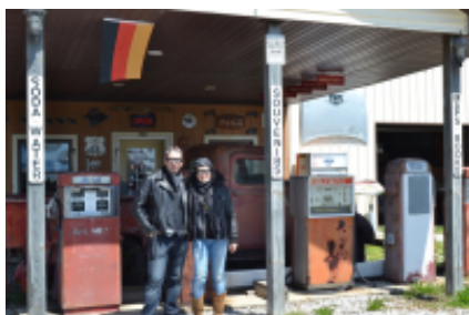
6 - Oljato-Monument Valley - Bryce Canyon City - 544 km