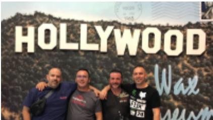
16 - Los Angeles - Los Angeles - 0 km