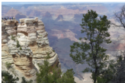
5 - Grand Canyon - Oljato-Monument Valley - 272 km