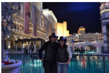
4 - Laughlin - Grand Canyon - 392 km