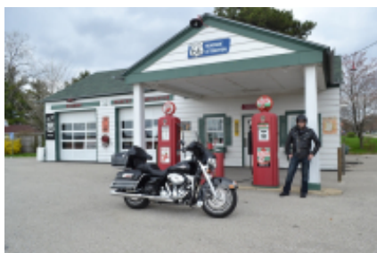
2 - Los Angeles - Palm Springs - 304 km