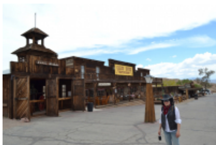
3 - Palm Springs - Laughlin - 371