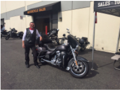
15 - Pismo Beach - Los Angeles - 360 km