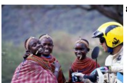
8 - Maji Moto - Nairobi - 140 km