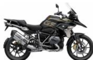
R 1250 GS LC + $0.00