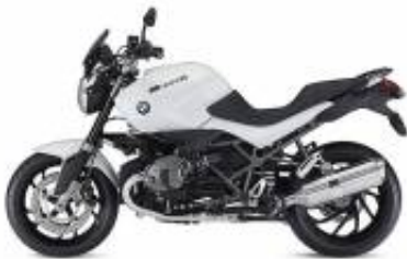
R 1200 R + $105.33