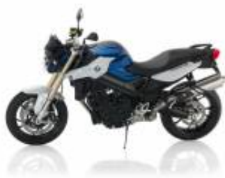
F 800 R + 600,00 €