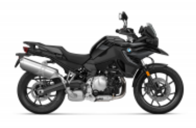
F 750 GS + R$ 11.158,33