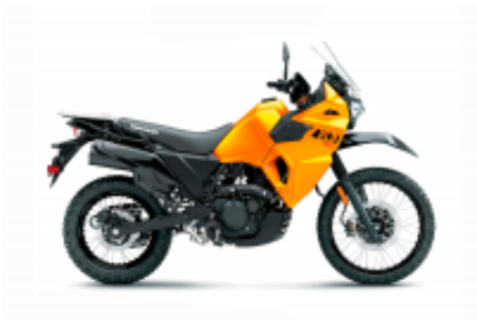
KLR 650 + ¥25,251