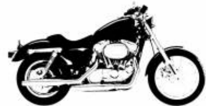
R 18 Transcontinental + ¥0