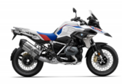
R 1250 GS + $115.97