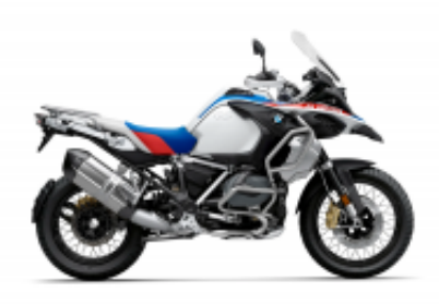
R 1250 GS Adventure + $173.96