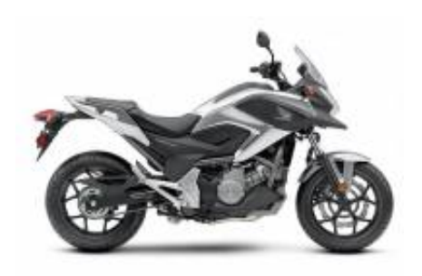
NC 750 X + £0.00