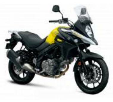
DL 650 V Strom + £150.76