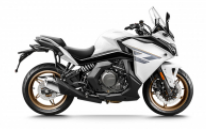
650GT + £890.00