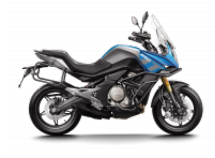
650MT 2022 + £890.00