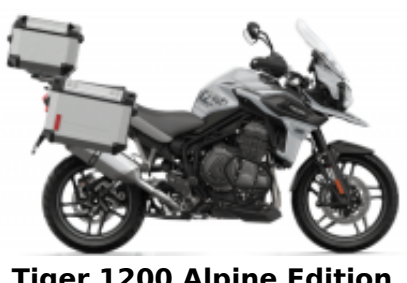
Tiger 1200 Alpine Edition + £1,700.00