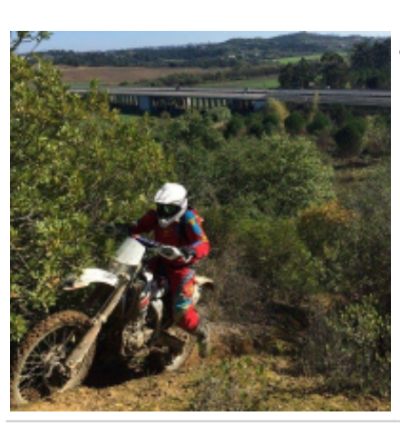
5 - Santarem - Santarem - 140 km