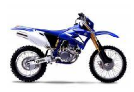
WR 450 + $0.00