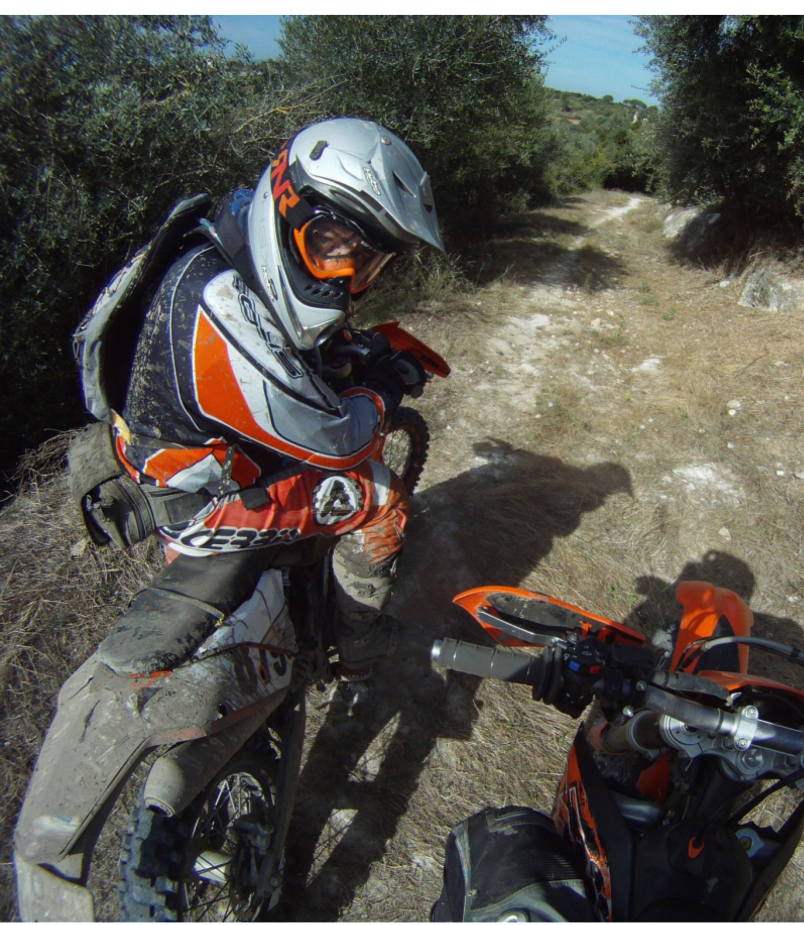
Motorcycle Enduro off Road tour Portugal Lisbon