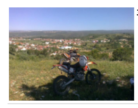
3 - Santarem - Santarem - 150 km