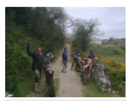
2 - Santarem - Santarem - 160 km