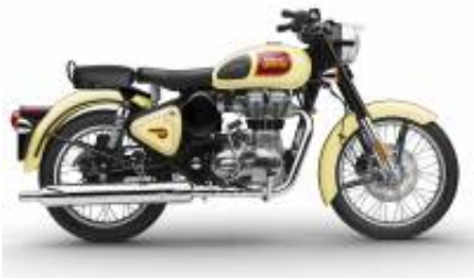
Classic 500 + $0.00