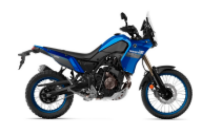
Tenere 700 + ¥10,208