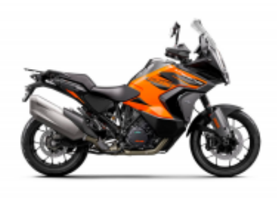
1290 Super Adventure S + $0.00