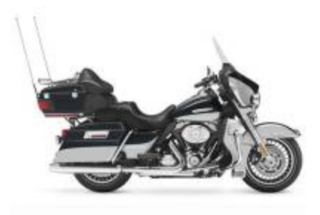
Road Glide Ultra Grand Touring Class + $0.00