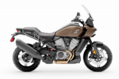
Pan America 1250 + $0.00