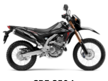
CRF 250 L + R$ 687,94