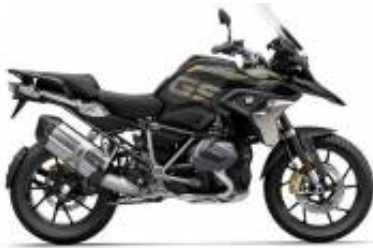
R 1250 GS LC + R$ 751,32