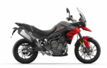
Tiger 850 Sport + £75.27