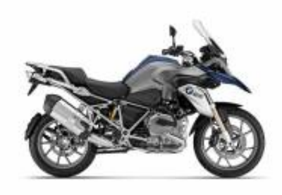
R 1200 GS + £338.70