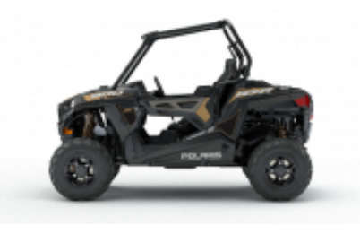
RZR 900 + $0.00