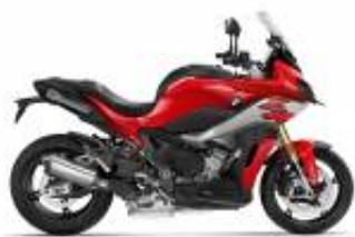
S 1000 XR + £131.88