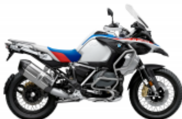
R 1250 GS Adventure + £131.88