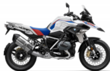
R 1250 GS + £87.92