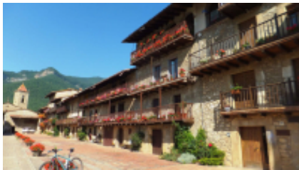
2 - Gérone - Les Preses - 65