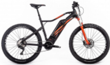
Graveler Sport Drive 10V 27,5 20.ETM.30 + $52.06

Dia extra en Girona, con visita guiada al casco antiguo. Els Banys Àrabs, El Call Jueu (Barrio Judío), la imponente catedral, las serpenteantes murallas romanas o los magníficos callejo