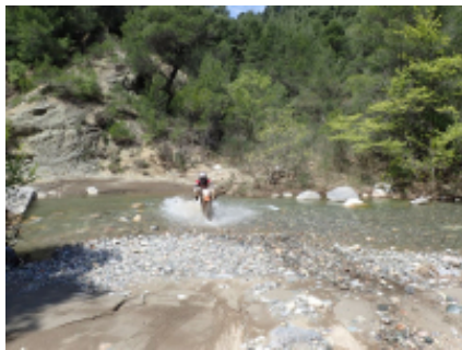
1 - Athènes - Athènes - 0