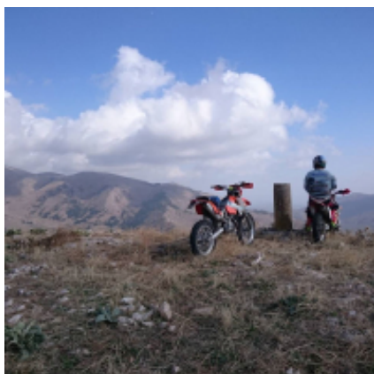
2 - Athènes - Corinthe - 140