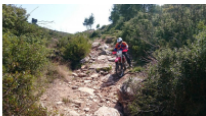
3 - Corinthe - Nauplie - 110