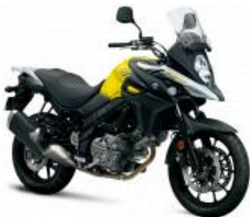
DL 650 V Strom + $0.00