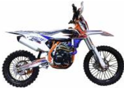
Sixdays 450 + $0.00