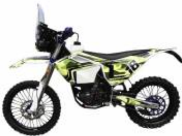
Rally 450 + $0.00