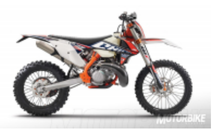
300 2T six days + $1,034.41