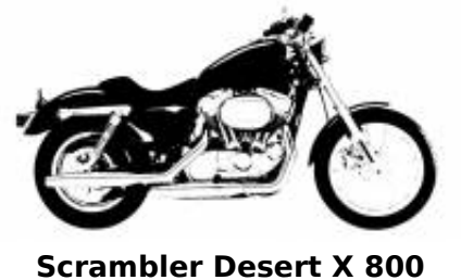
Scrambler Desert X 800 + $0.00