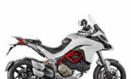
Multistrada 1260 V4 + $0.00