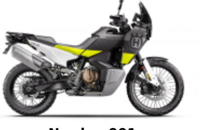
Norden 901 + $0.00