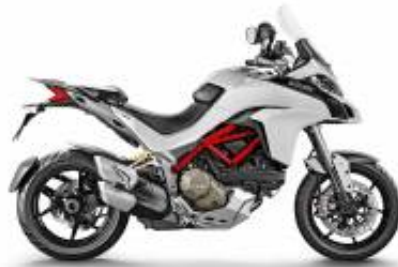
Multistrada 1260 V4 + $0.00