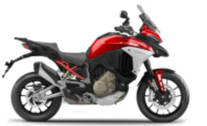
Multistrada V4 + $0.00