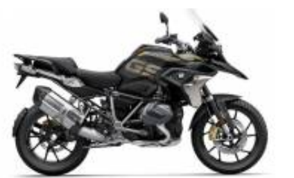
R 1250 GS LC + $0.00