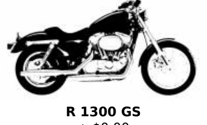
R 1300 GS + $0.00