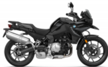
F 750 GS + $2,022.98