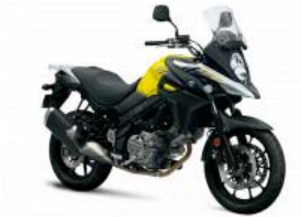
DL 650 V Strom + R$ 1.131,32