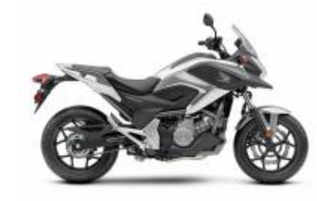
NC 750 X + R$ 0,00